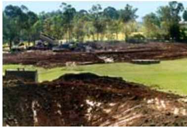
13 th Hole During Construction