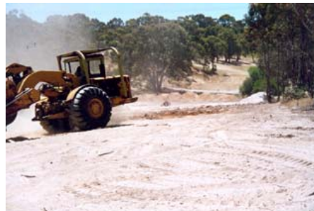
Top-soiling and Drainage