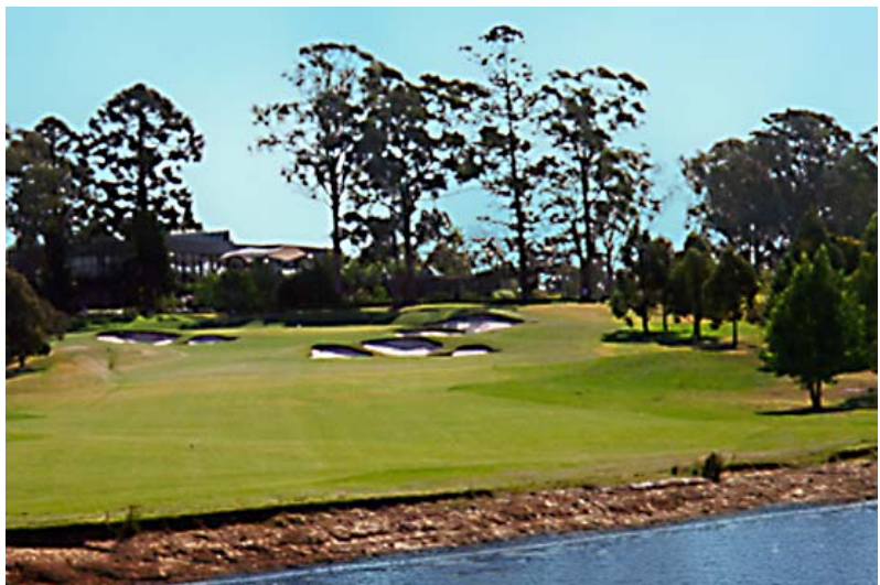
18 th Hole After