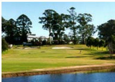
18 th Hole Before

The clay subsoil has required that extensive sub-surface drainage be installed and proper attention be paid to surface drainage. The greens are drained using an aggregate layer over pipes and beneath a sandy profile. Construction of bunkers to produce natural lines was difficult because of clay but the result has been universally praised.