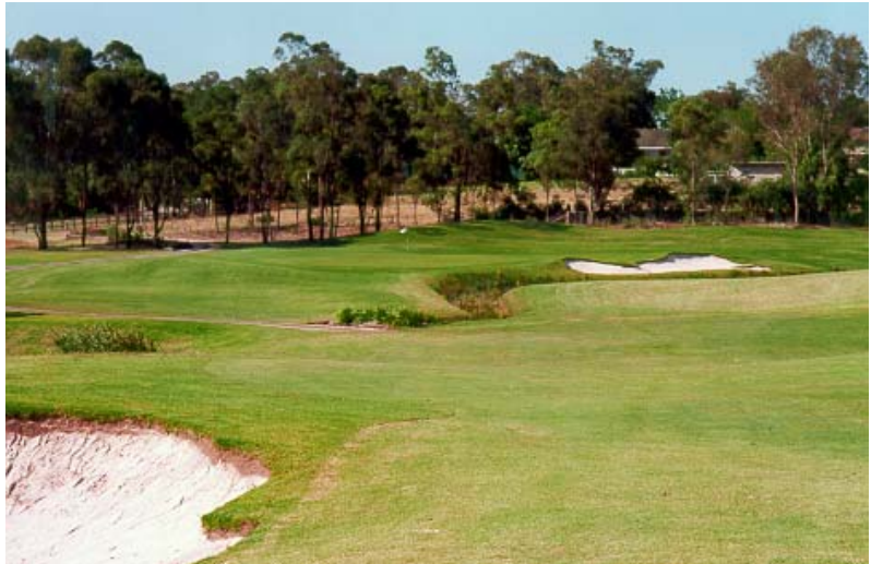
13 th Hole After Construction

To bring Castle Hill Golf Course into line with the Group One courses in Sydney, a Masterplan (NGS) was prepared to enable gradual implementation of a new design minimising interference to member play.